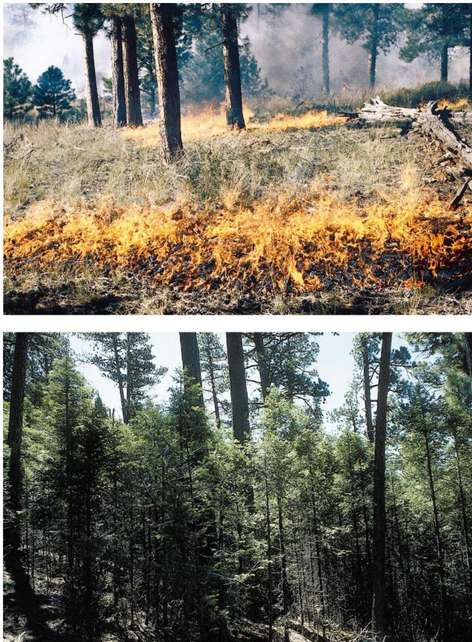
FIG. 1. Ponderosa pine forests of the American Southwest. (Top) Open ponderosa pine forest representing “typical” pre-1900 conditions, with grassy understory and surface fire activity. (Bottom) Altered ponderosa pine stand in need of restoration, showing changes in both stand structure and species composition. The dense midstory of mixed conifer trees provides ladder fuels that favor crown fire development.

port the development and implementation of a diverse range of scientifically viable restoration approaches in these forests that address the critical issues of forest heterogeneity, scientific uncertainty, and effects on wildlife. In addition, we suggest principles for ecologically sound restoration approaches. It is not our intention to emphasize a critique of any particular model, but we do present ecological perspectives on several alternative forest restoration approaches.