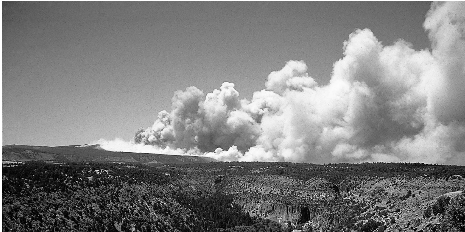
FIG. 2. View looking northwest at the Cerro Grande Fire on the afternoon of 10 May 2000 as it burned toward Los Alamos, New Mexico (USA). Similar large, stand-replacing fires are becoming increasingly common in Southwestern ponderosa pine forests.

scape scales (Cooper 1960, White 1985), with pattern shifts through time within a natural range of variability (Swetnam et al. 1999).