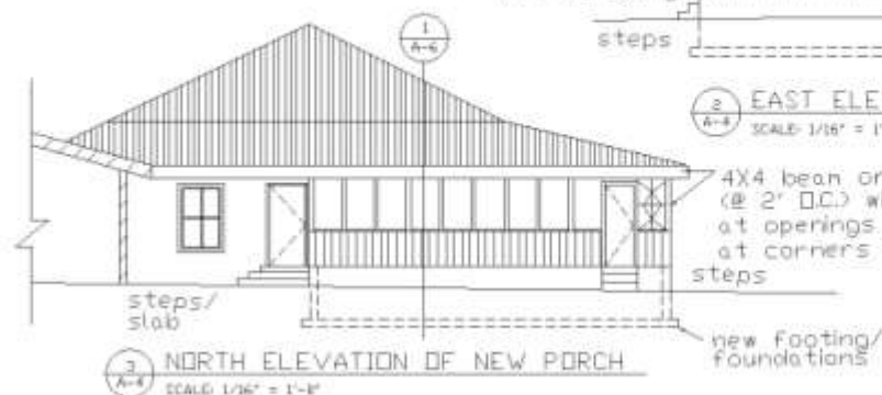
3 NORTH ELEVATION OF NEW PORCH SCALE: 1/16" = 1'-0"